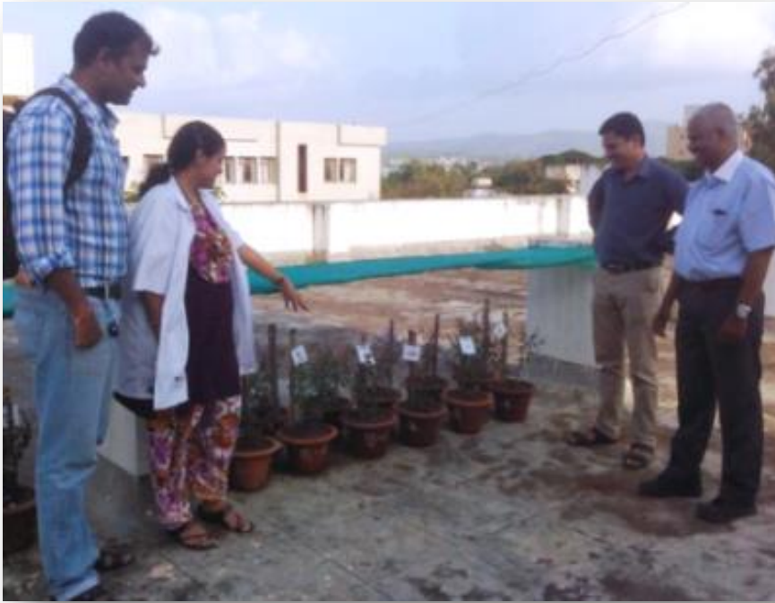
Observations of Tulasi Saplings – Minor Project (2016)