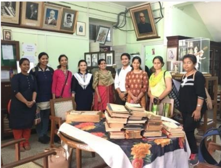
Handling the manuscripts in the visit to Bhandarkar Oriental Research Institute, Pune.