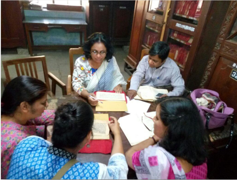
Visit of PG students to Bhandarkar Oriental Research Institute, Pune.