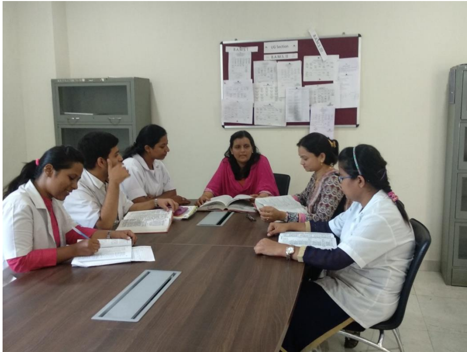
Reading 'in between lines' of commentaries of Ayurveda