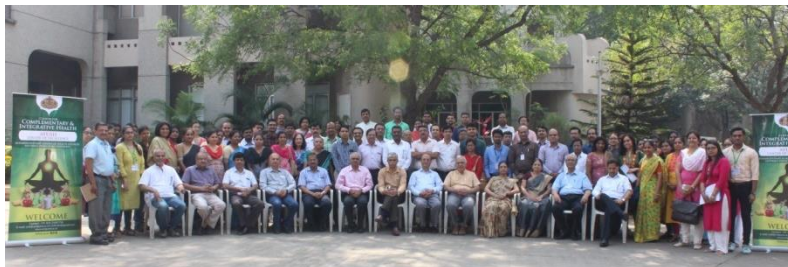
Participation of Teaching staff in Interactive workshop at Pune University organized by Dept. of AYUSH