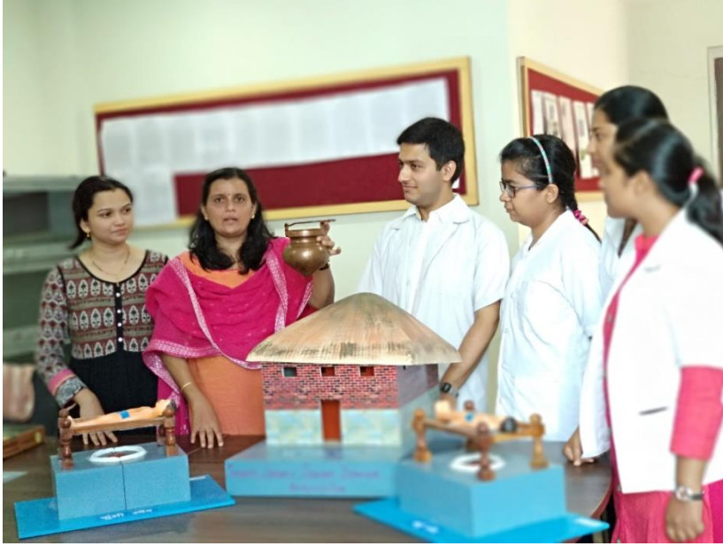
Demonstration of Models