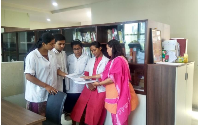
Handling of rare manuscripts of Ayurved at Department.