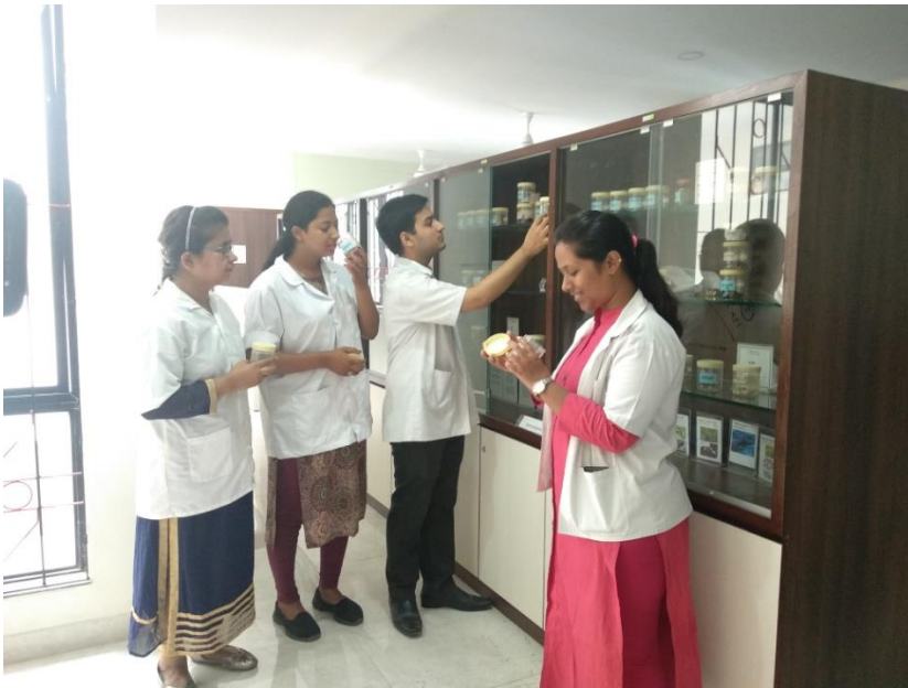
Students studying at Dravya-Sangrahalaya in Department