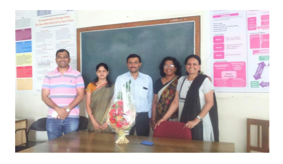
Students at laboratorial practical