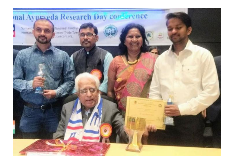
Awards & Achievements of Students.