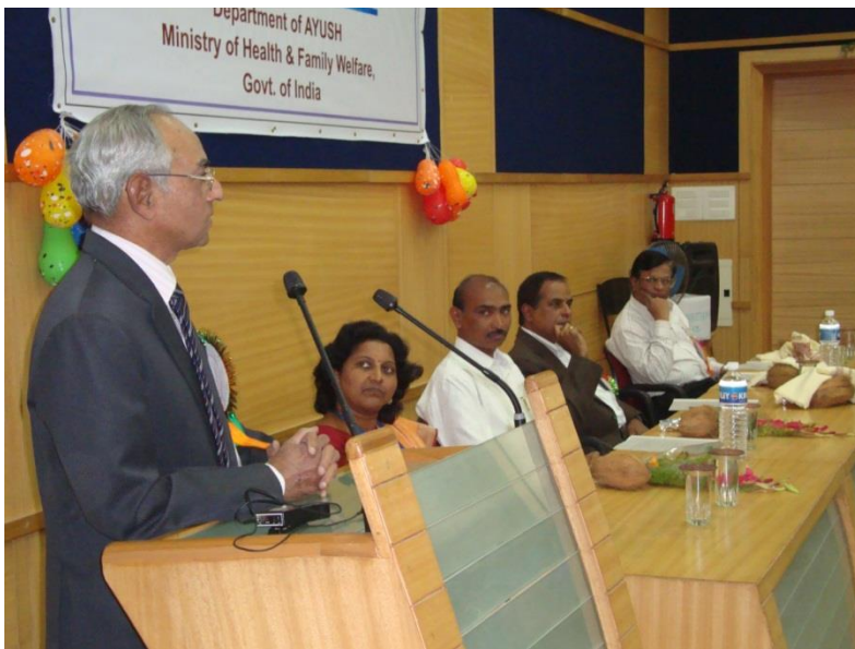
Inaguration RoTP program funded by AYUSH