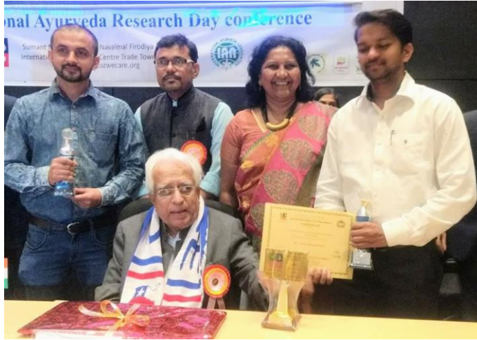
Awards & Achievements of Students.