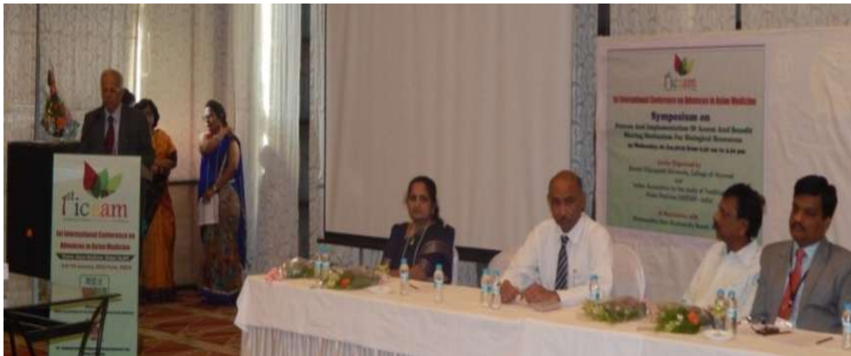
Symposium organized on the Process & Implementation of Access and benefit sharing mechanism for biological resources.