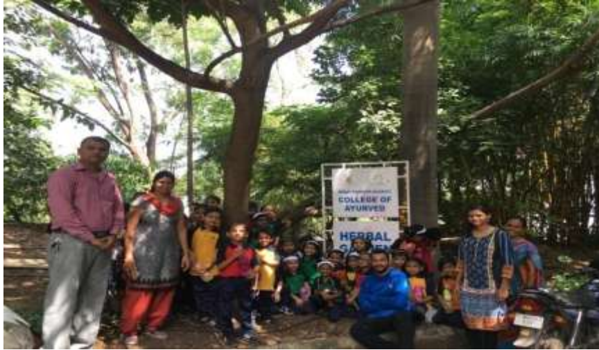
Tree plantation at Herbal garden