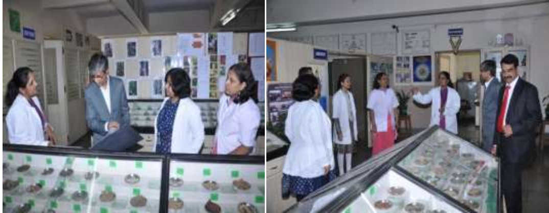
Faculty in discussion room