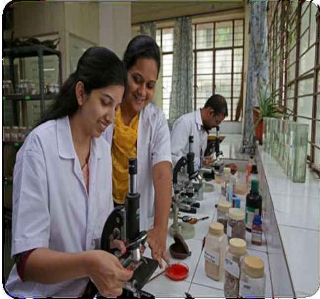
Students engaged in Practical

Hon. Secretary of AYUSH visit the department during NAAC inspection