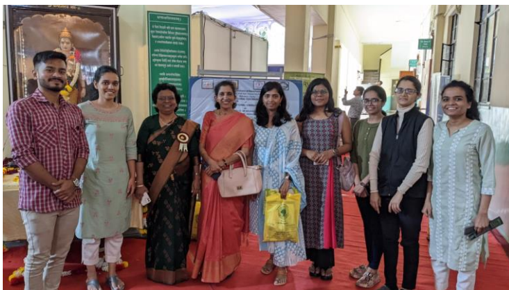
Postgraduate students of department and HOD : Poster Presentation at National seminar on Rasa Shastra : Concepts to Practices organized by TAMV, Pune. August 2023