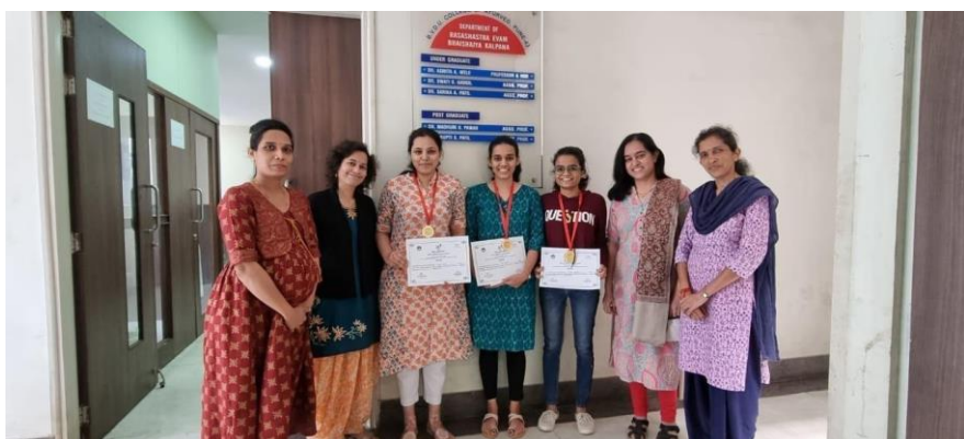
Postgraduate Students of department received prizes in National conference 2021