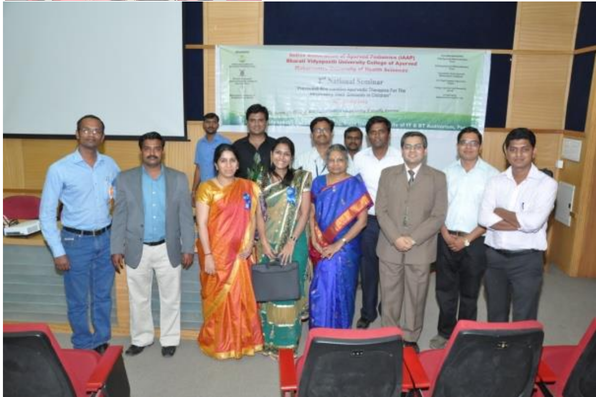
Dignitaries present and the Organizing team of the National Seminar conducted by the department in 2013