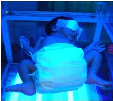
Patients Requiring And Receiving Neonatal Care In The Neonatal Unit At Bharati Ayurved Hospital.