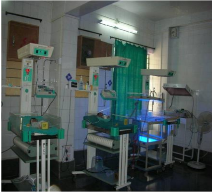
A Fully Functional Level II Neonatal Care Unit