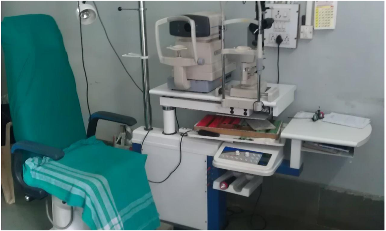
OPHTHALMIC CHAIR UNIT