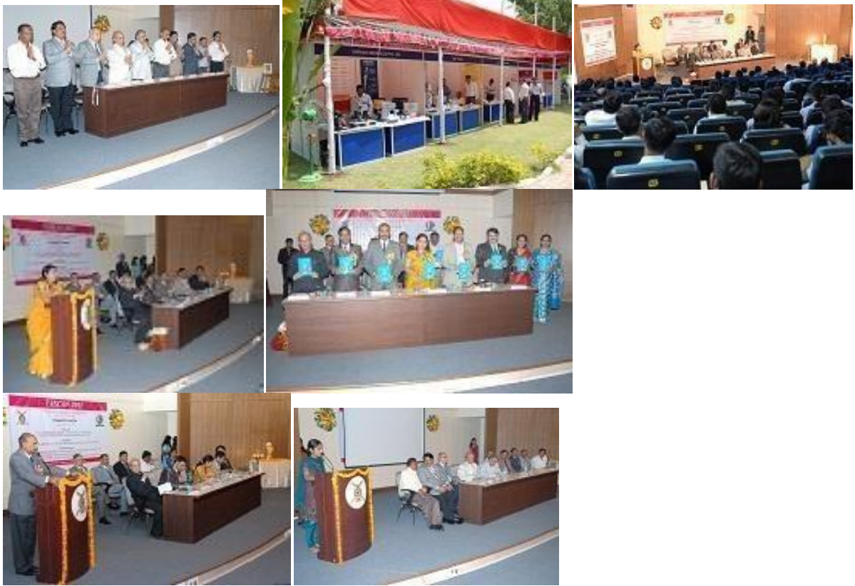
SEMINAR (ORGANISED BY DEPARTMENT) PHOTOS