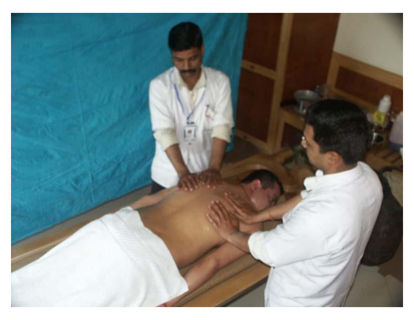
EXECUTIVE PANCHAKARMA CENTER