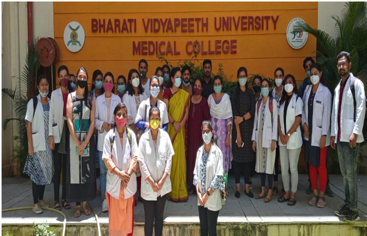
Visit to Animal House BVDU in 2021 with MD Prelim students.