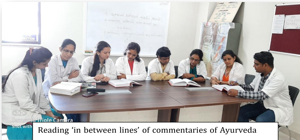
Reading 'in between lines' of commentaries of Ayurveda