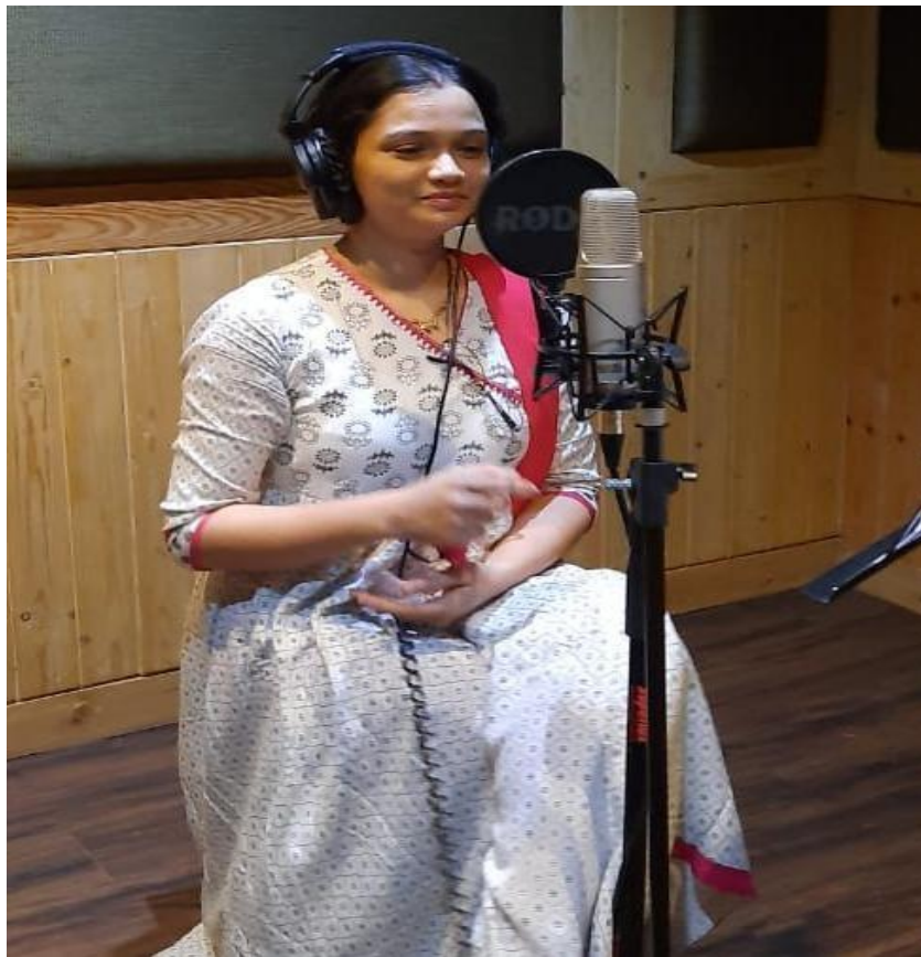
Faculty giving Voice over for the Official documentary of BVDUCOA, Pune on You Tube 2020.