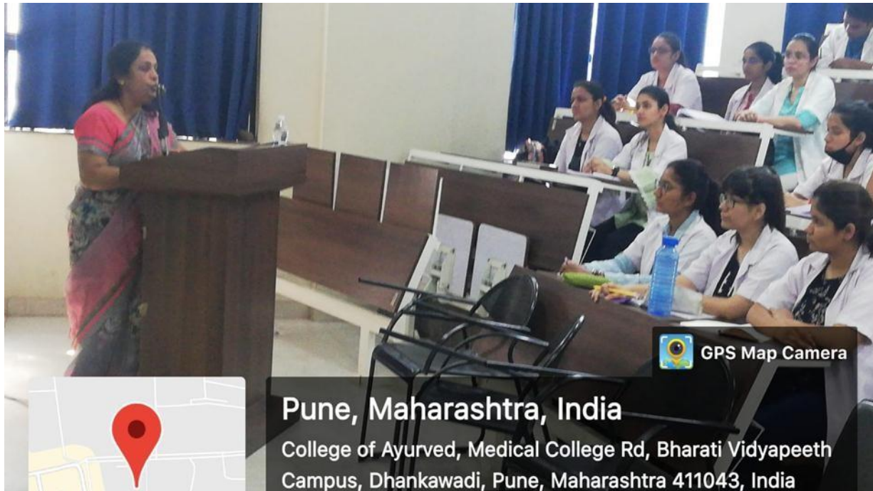
Faculty conducting Yoga and Meditation session in the Transitional Curriculum of 1 st BAMS 2022 .