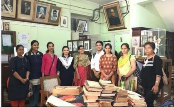
Handling the manuscripts in the visit to Bhandarkar Oriental Research Institute, Pune.