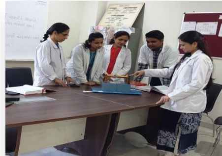
Hands on learning on Model