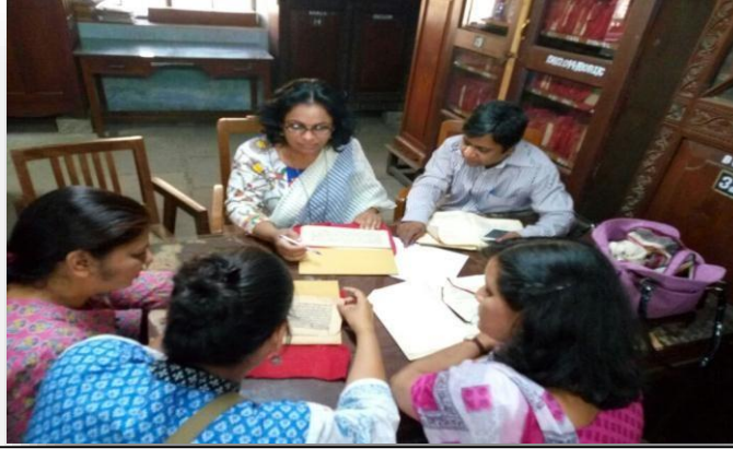
Visit of PG students to Bhandarkar Oriental Research Institute,Pune