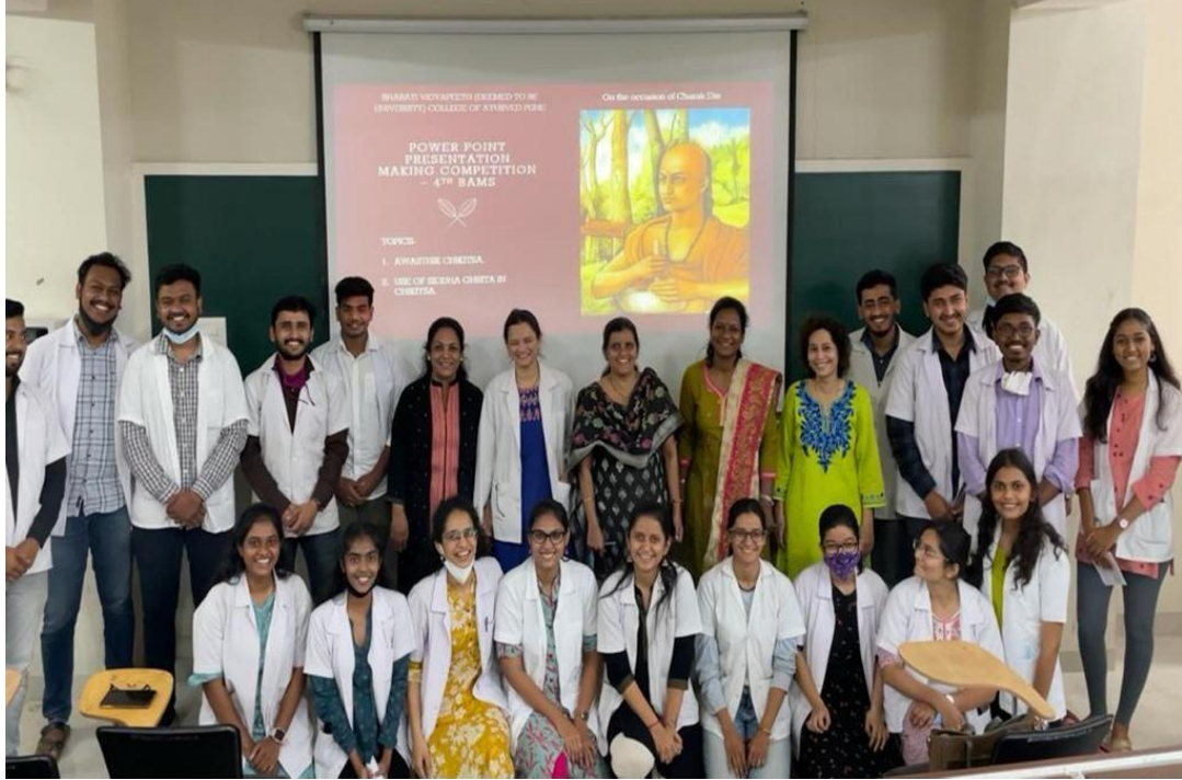
The Faculty of Samhita Department with the Judges and Participants of PPT competition of 4 th year BAMS in 2021.