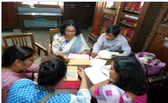
Visit of PG students to Bhandarkar Oriental Research Institute, Pune