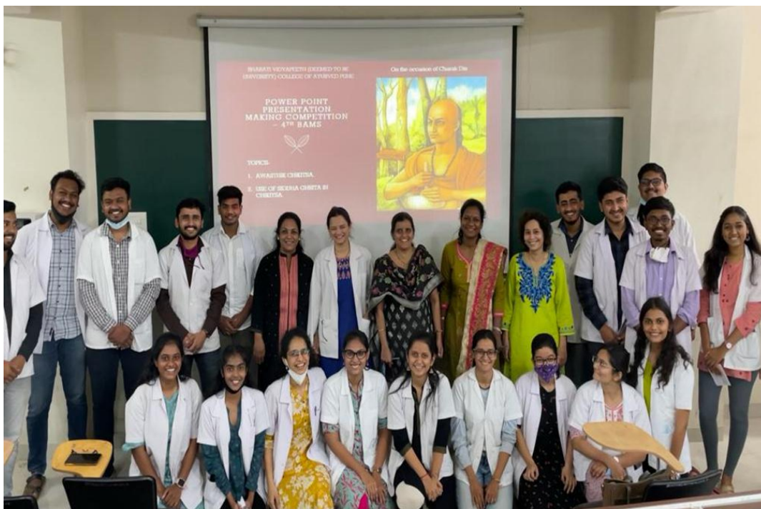
The Faculty of Samhita Department with the Judges and Participants of PPT competition of 4 th year BAMS in 2021.