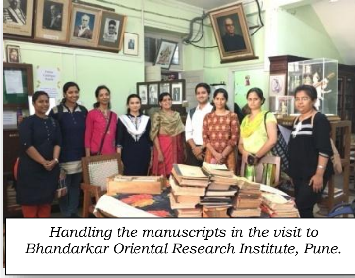
Handling the manuscripts in the visit to Bhandarkar Oriental Research Institute, Pune.