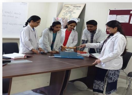
Hands on learning on Model