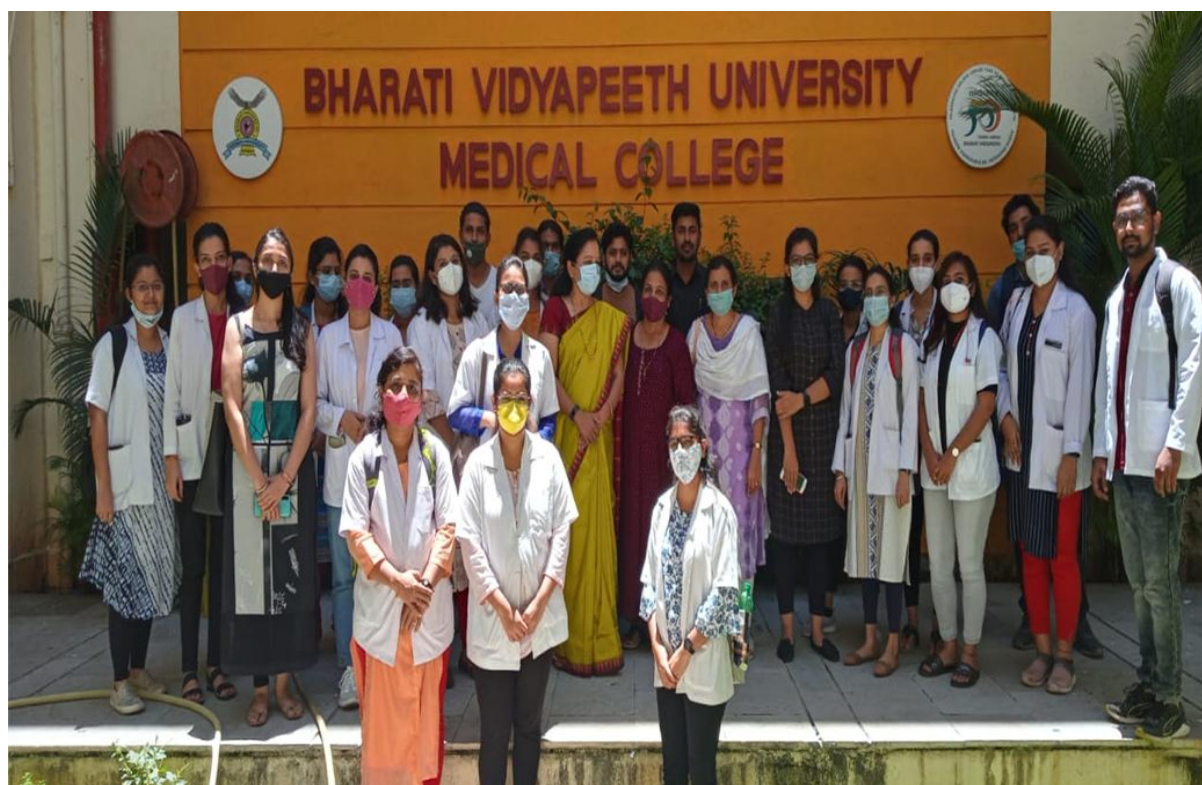
Visit to Animal House BVDU in 2021 with MD Prelim students.