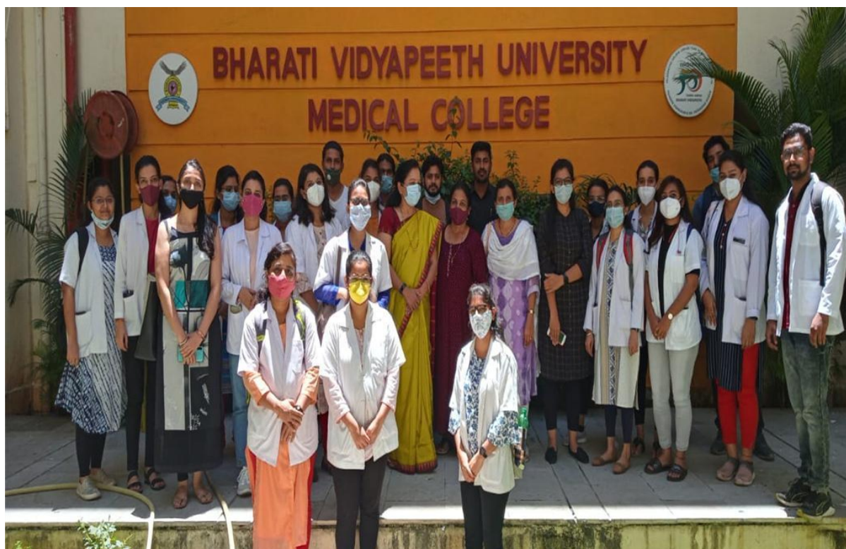
Visit to Animal House BVDU in 2021 with MD Prelim students.