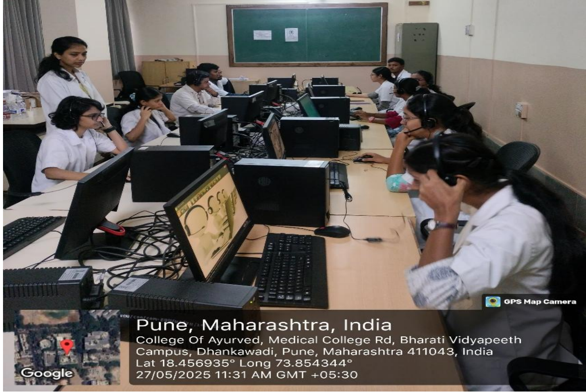
Sanskrit Language Lab