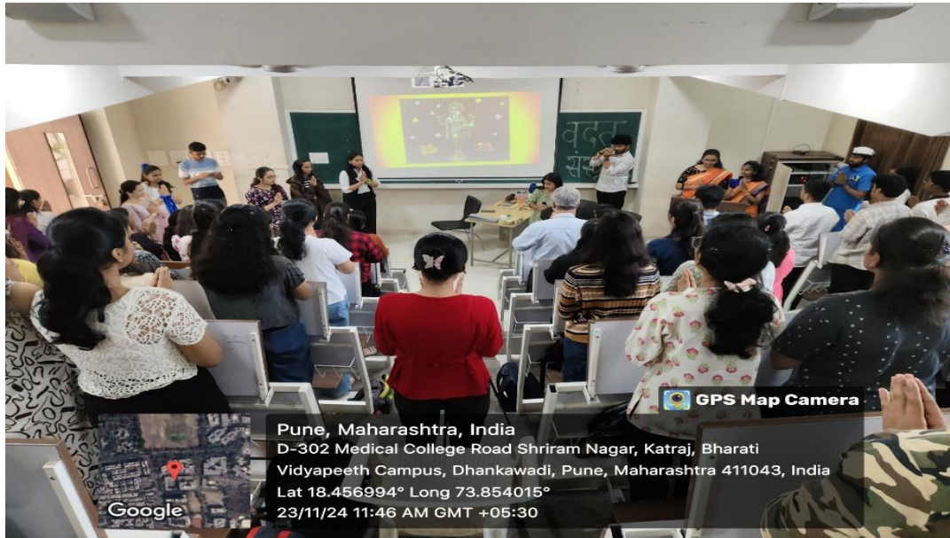
Sanskrit Drama First BAMS