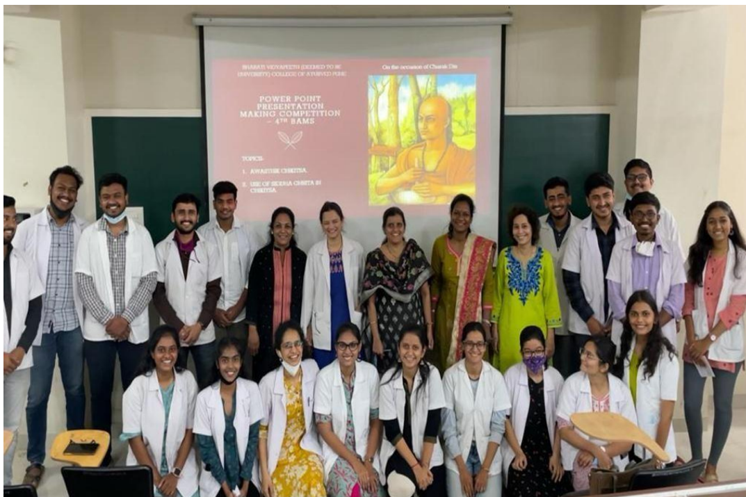
The Faculty of Samhita Department with the Judges and Participants of PPT competition of 4 th year BAMS in 2021.