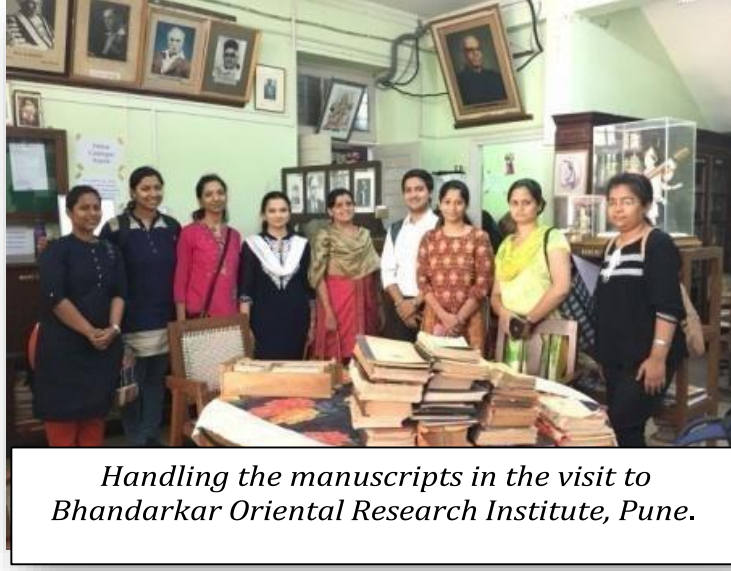
Handling the manuscripts in the visit to Bhandarkar Oriental Research Institute, Pune.