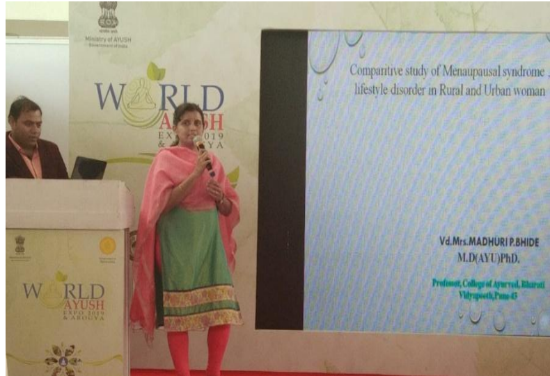
First Prize for World Ayush Seminar Held at Navi Mumbai held by Ayush Dept. and DyPatil College. (August -2019)