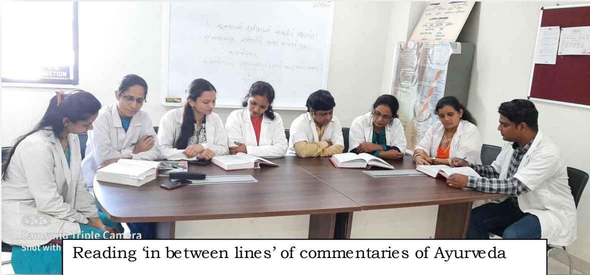
Reading 'in between lines' of commentaries of Ayurveda