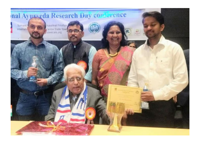
Awards & Achievements of Students.