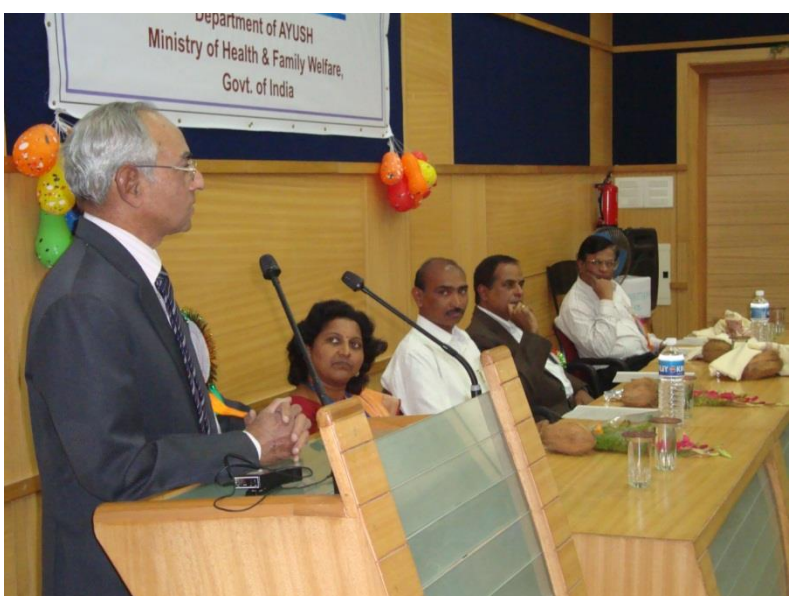
Inaguration RoTP program funded by AYUSH