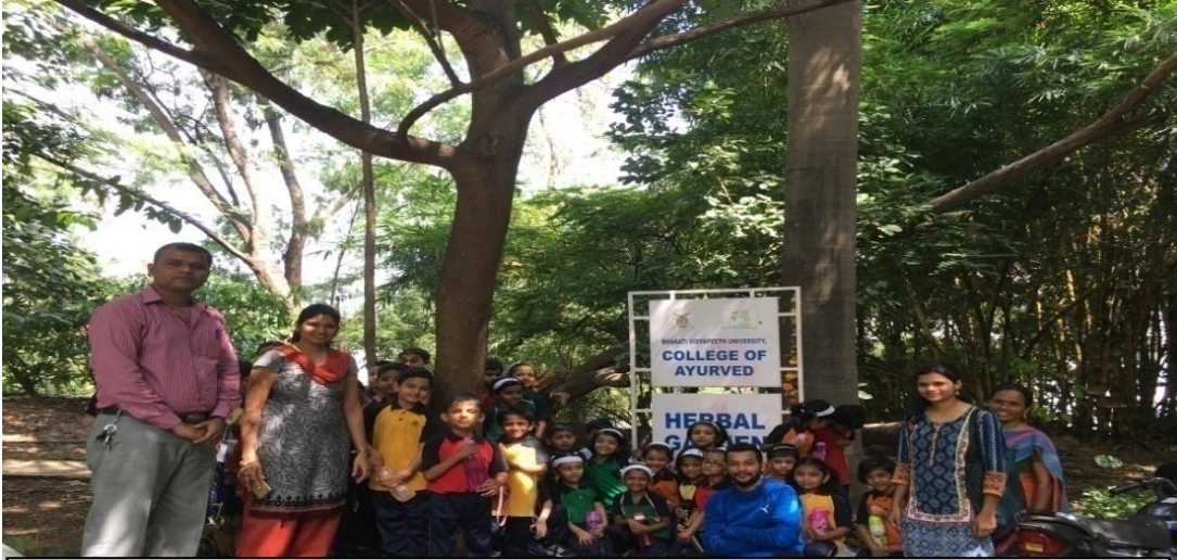
Visit of Primary school students of Karmaveer School of Bharati Vidyapeeth