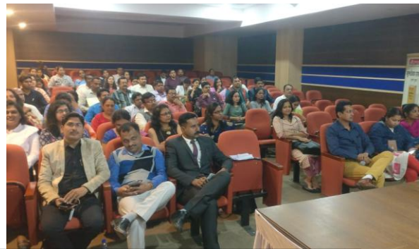
Awareness Program in collaboration with Shri Baidyanath, Nagpur