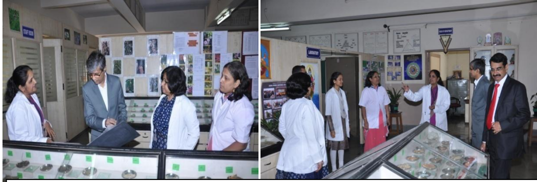
Hon. Secretary of AYUSH visit the department during NAAC