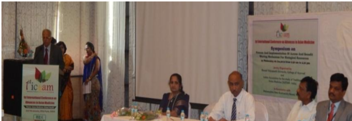
Symposium organized on the Process & Implementation of Access and benefit sharing mechanism for biological resources