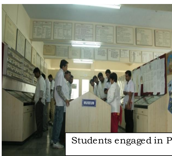
Students engaged in Practical