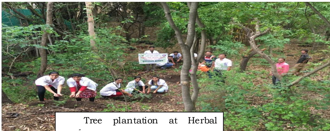
Tree plantation at Herbal