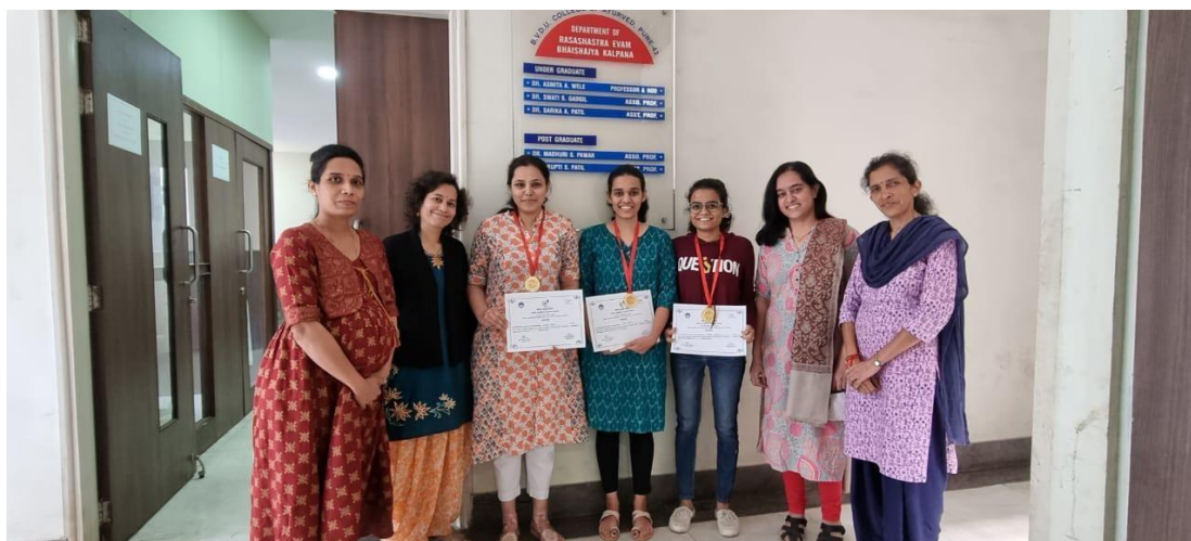
Figure 7: PG students who received prizes in different competitions at national level 2021