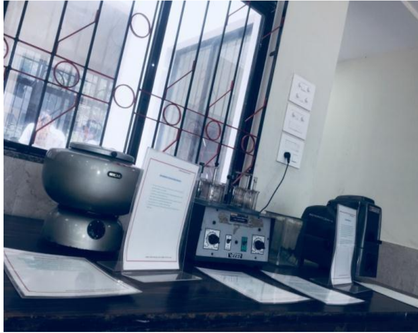
Figure 2 The quality control lab