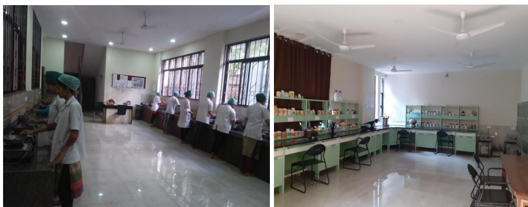
UG & PG PRACTICAL LABORATORY- PG RESEARCH LABORATORY