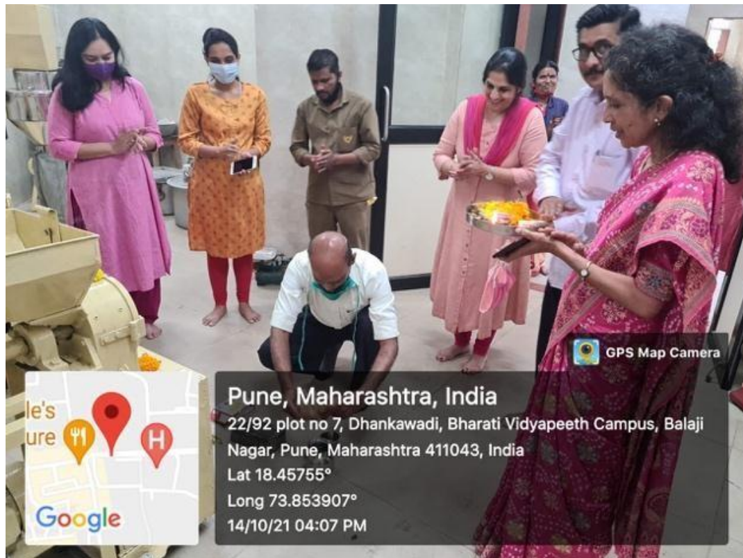
Figure 3: Beginning of new production year of the pharmacy on Dashahara 2021