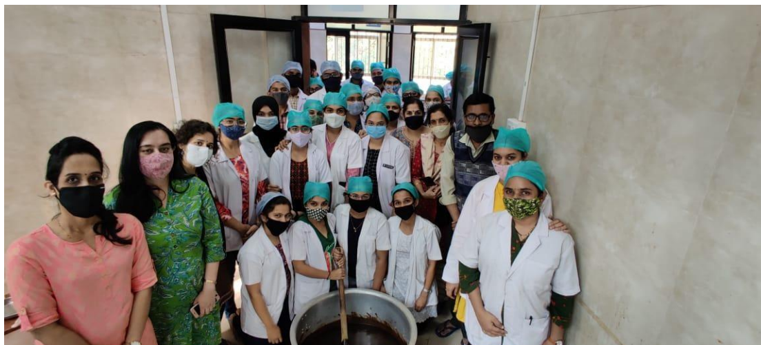
Figure 6 Making of Chavanprash 2021