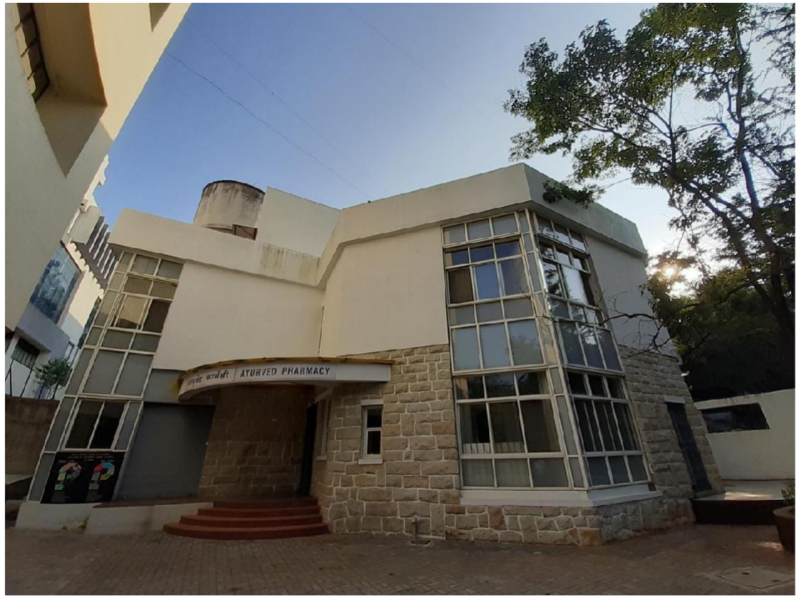
Figure 1 Ayurveda Pharmacy