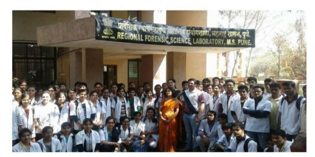
VISIT TO FSL PUNE