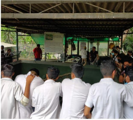
VISIT TO RAJIV GANDHI ZOOLOGICAL PARK PUNE