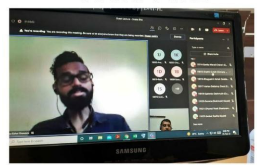
ONLINE GUEST LECTURE ON SNAKE BITE