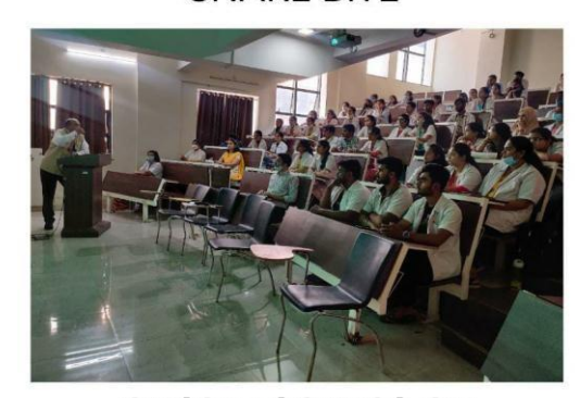
GUEST LECTURE ON FUNCTIONING OF FSL