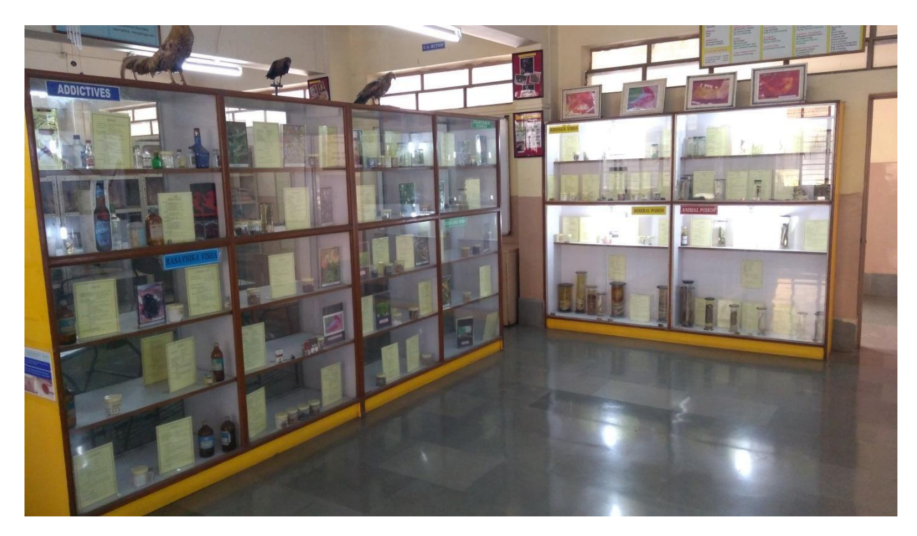
Departmental museum with animate and inanimate poisonous specimens