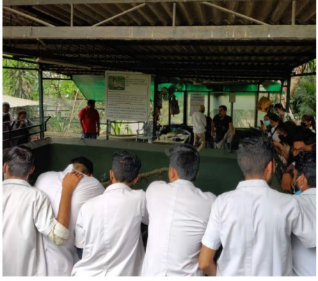
VISIT TO RAJIV GANDHI ZOOLOGICAL PARK PUNE