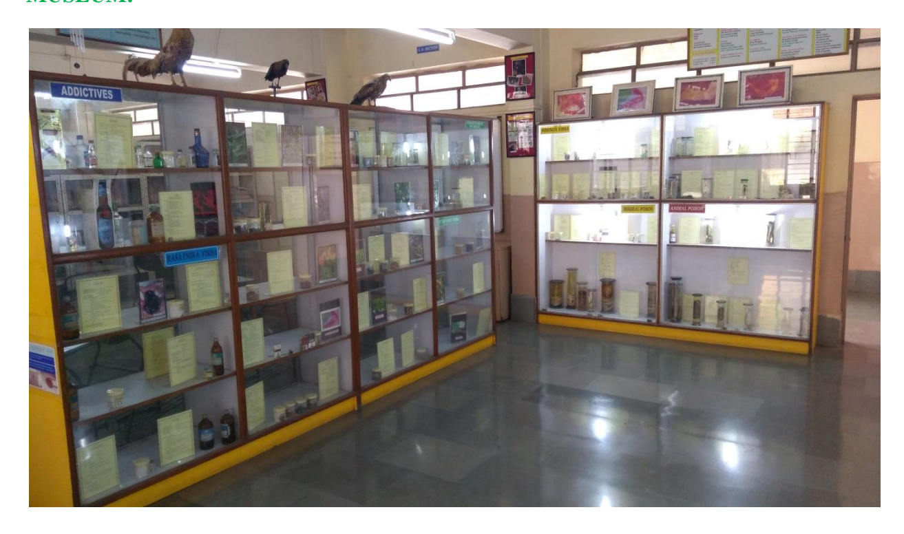
Departmental museum with animate and inanimate poisonous specimens