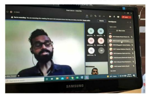
ONLINE GUEST LECTURE ON SNAKE BITE