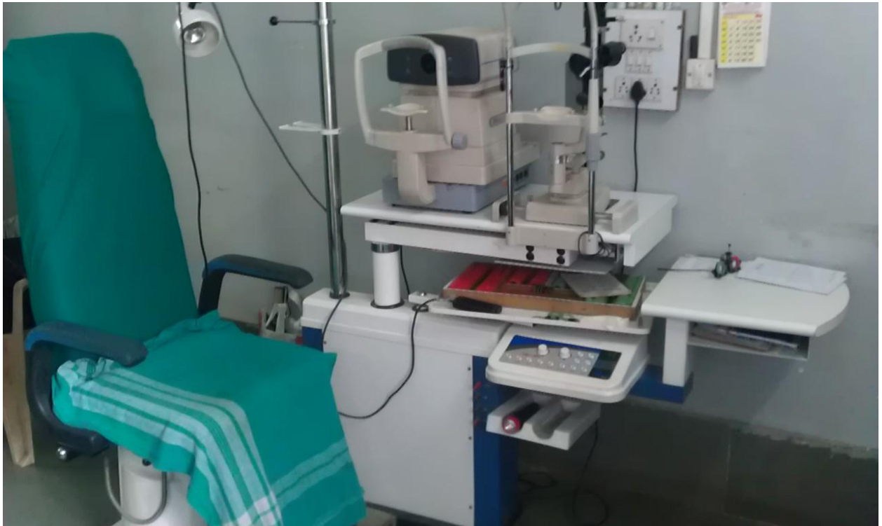
OPHTHALMIC CHAIR UNIT