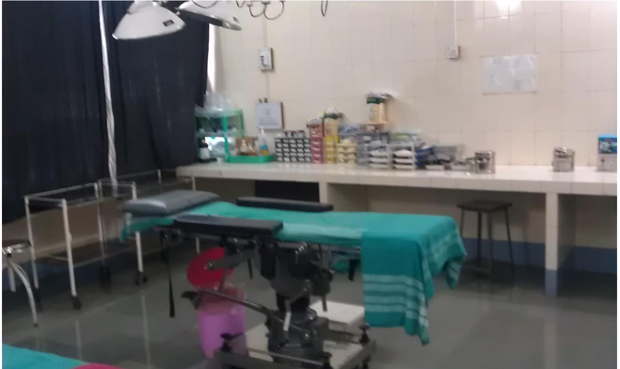
E.N.T. OPERATION TABLE