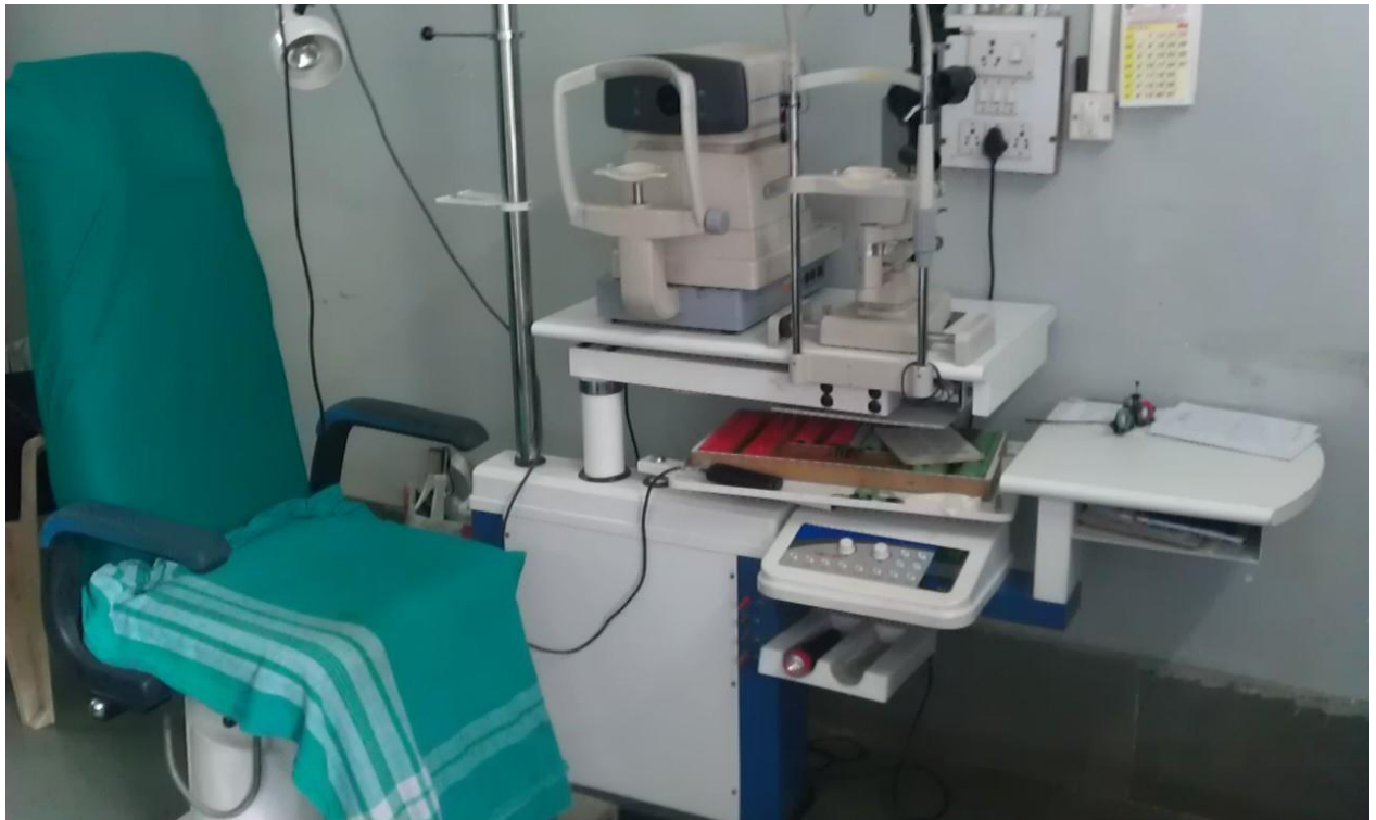
OPHTHALMIC CHAIR UNIT