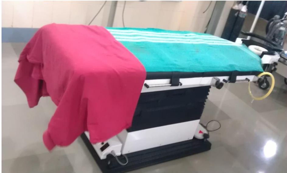
OPHTHALMIC OPERATION TABLE