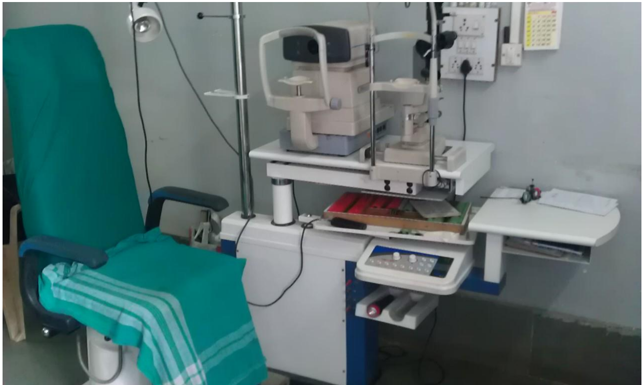
OPHTHALMIC CHAIR UNIT