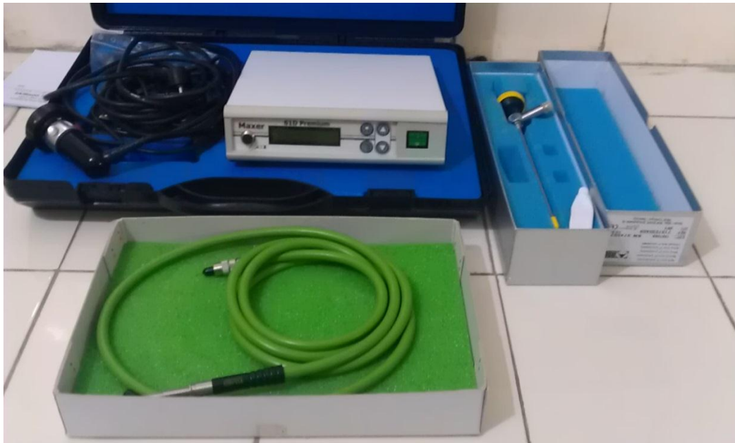
0 DEGREE ENDOSCOPE WITH FIBERPOPTIC CABLE AND MAXER ONE CHIP CAMERA