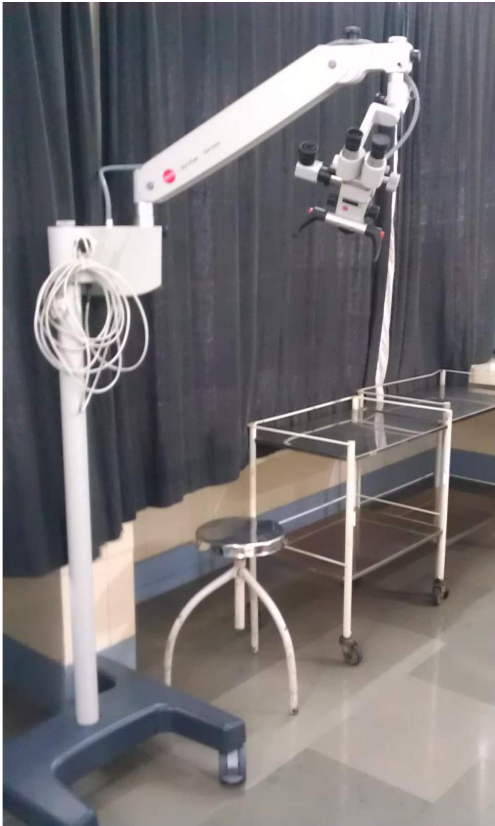
OTO-RHINO-LARYNGOLOGY OPERATIVE MICROSCOPE