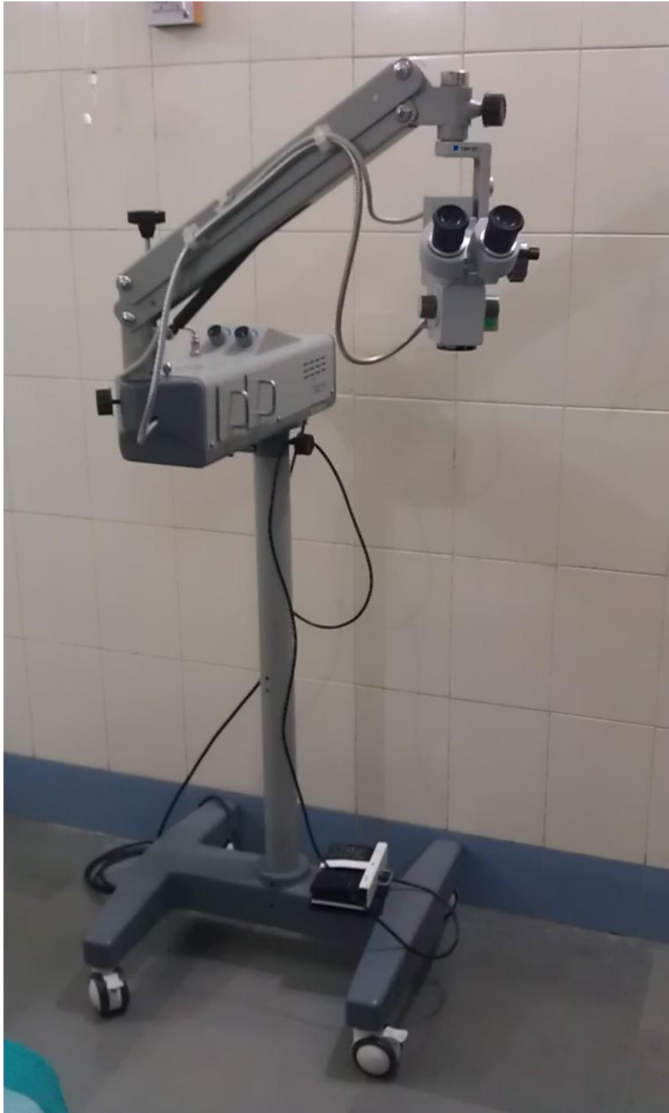
OPHTHALMIC OPERATIVE MICROSCOPE