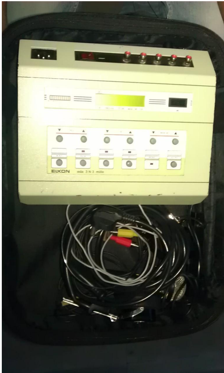
ELKON PURE TONE AUDIOMETER