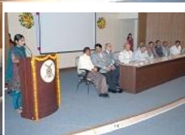
SEMINAR (ORGANISED BY DEPARTMENT) PHOTOS