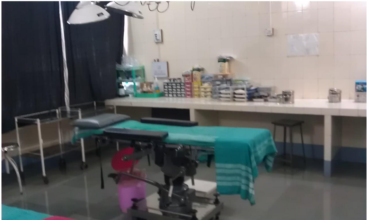
E.N.T. OPERATION TABLE