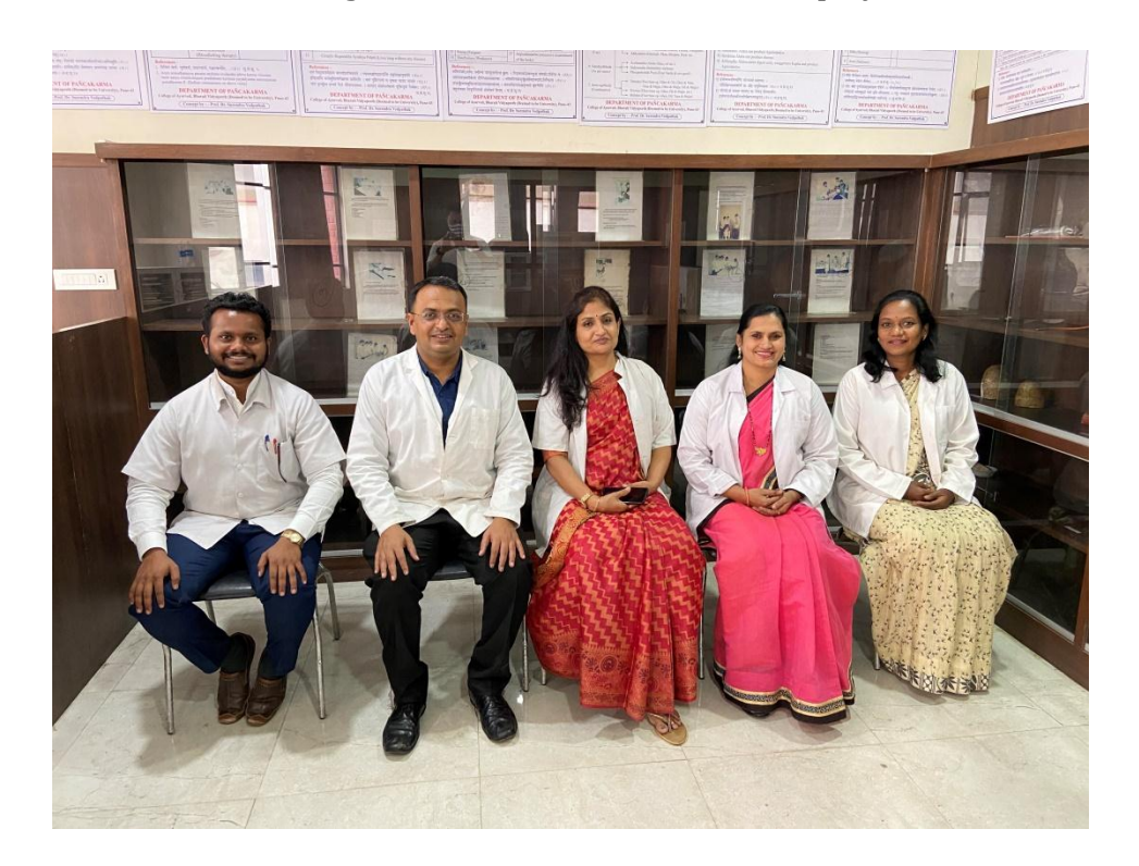
Showing department PG with Panchakarma Museum

displayed. Instrument like Basti Netra, Putak, Pradhaman Nasya Yantra, Gokarna. Raktamoksha Yantra like Shringa and Alabu Yantra are also displayed.