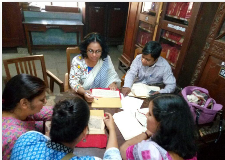
Visit of PG students to Bhandarkar Oriental Research Institute, Pune