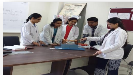
Hands on learning on Model