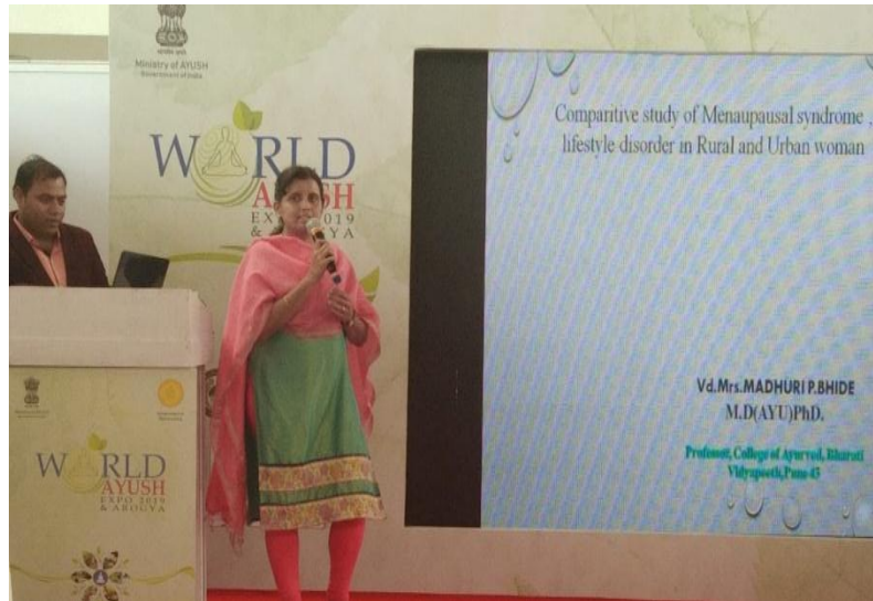
First Prize for World Ayush Seminar Held at Navi Mumbai held by Ayush Dept. and DyPatil College. (August -2019)