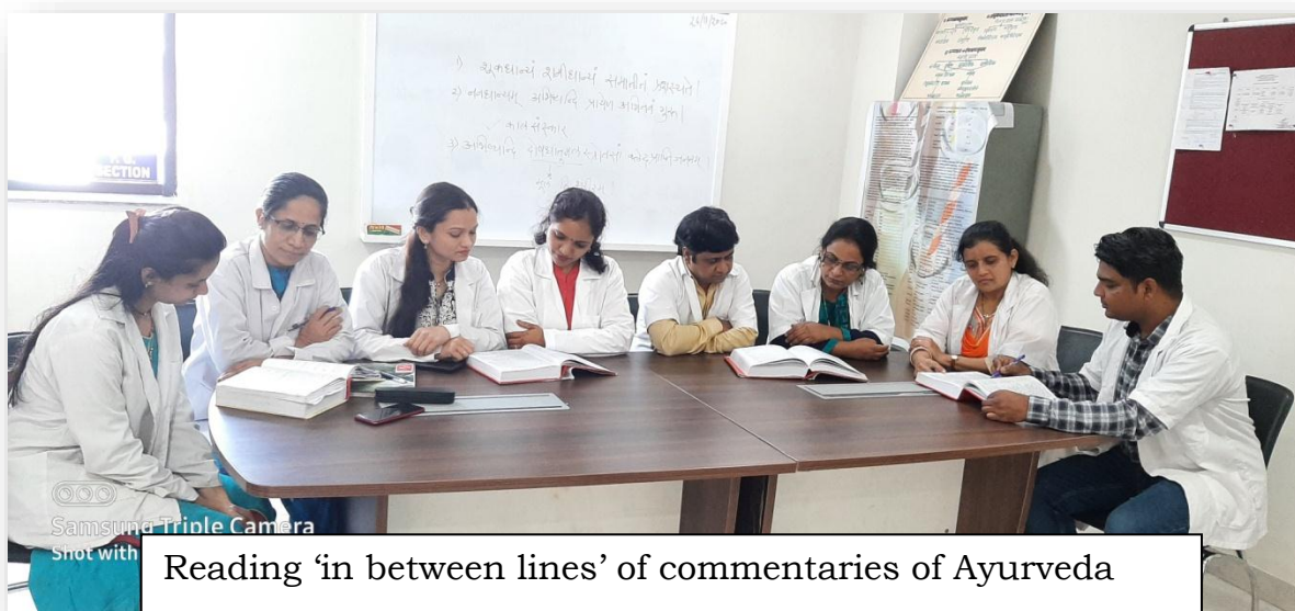
Reading 'in between lines' of commentaries of Ayurveda