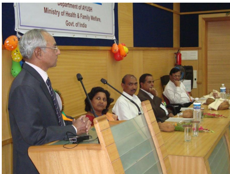
Inaguration RoTP program funded by AYUSH