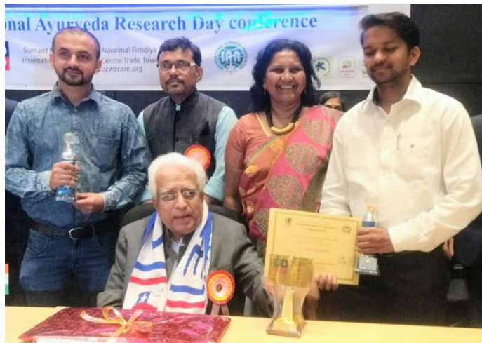
Awards & Achievements of Students.