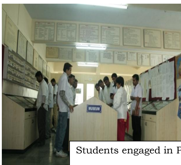
Students engaged in Practical