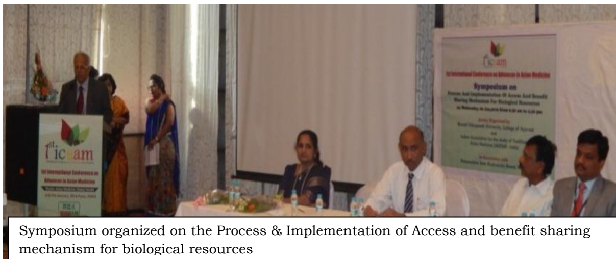
Symposium organized on the Process & Implementation of Access and benefit sharing mechanism for biological resources