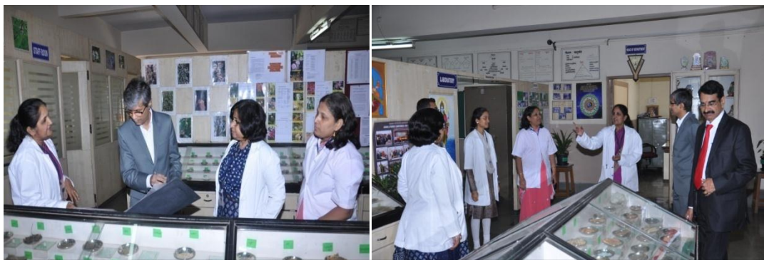
Hon. Secretary of AYUSH visit the department during NAAC