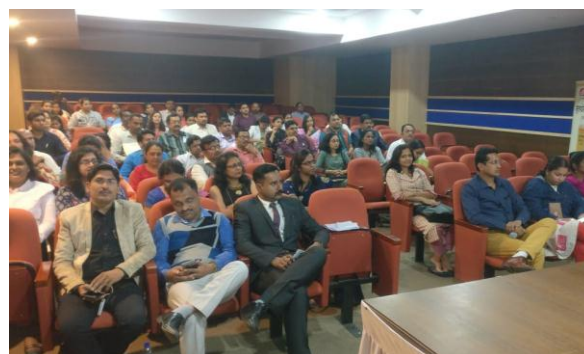
Awareness Program in collaboration with Shri Baidyanath, Nagpur