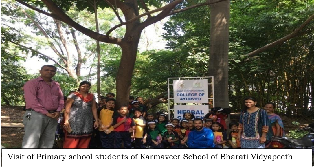
Visit of Primary school students of Karmaveer School of Bharati Vidyapeeth