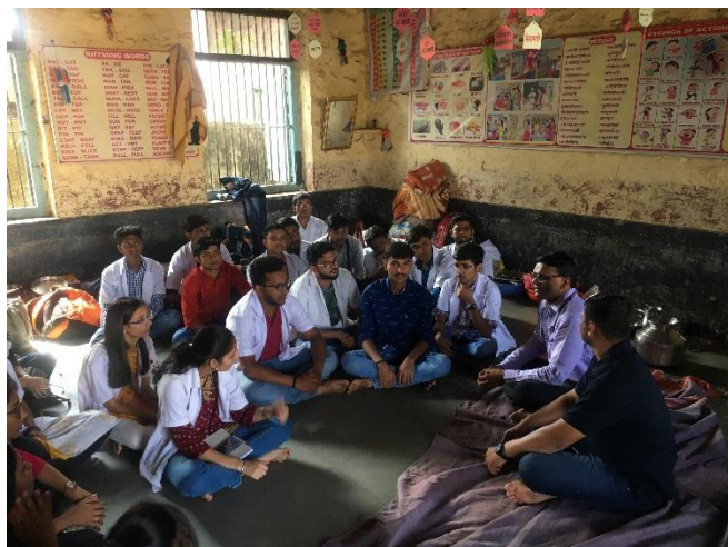
NSS Camp at Kamthadi Village