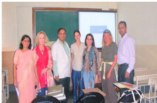
Health check-up Camp