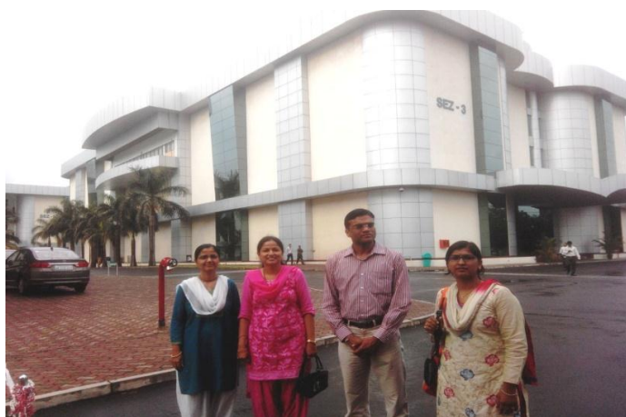
Postgraduate students visit to Serum Institute at Hadapsar, Pune.