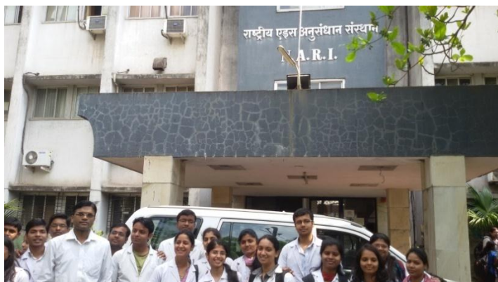
Under Graduate Students visit to NARI, Bhosari, PUNE.