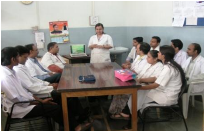
3) P.G. Students & Teaching staff