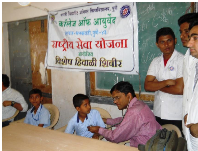
9) Academic visit of the department