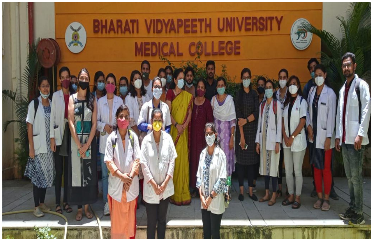
Visit to Animal House BVDU in 2021 with MD Prelim students.