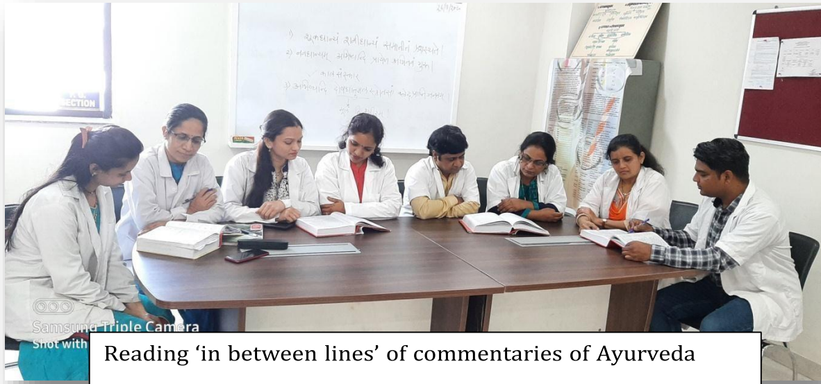
Reading 'in between lines' of commentaries of Ayurveda