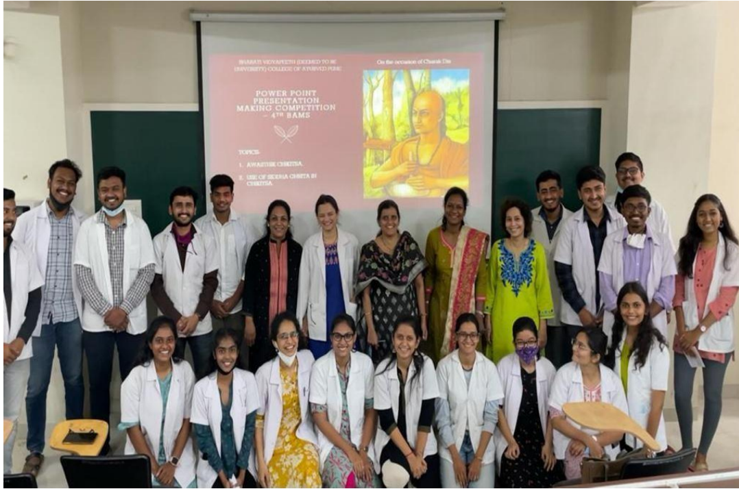
The Faculty of Samhita Department with the Judges and Participants of PPT competition of 4 th year BAMS in 2021.