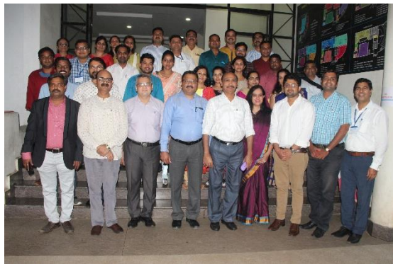
The organizing Team along with the participants