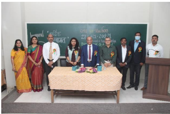
The Hosts, Organizing Team